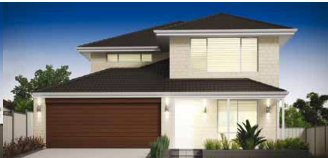
The Como Standard Option