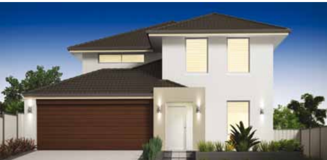
The Como Option 1