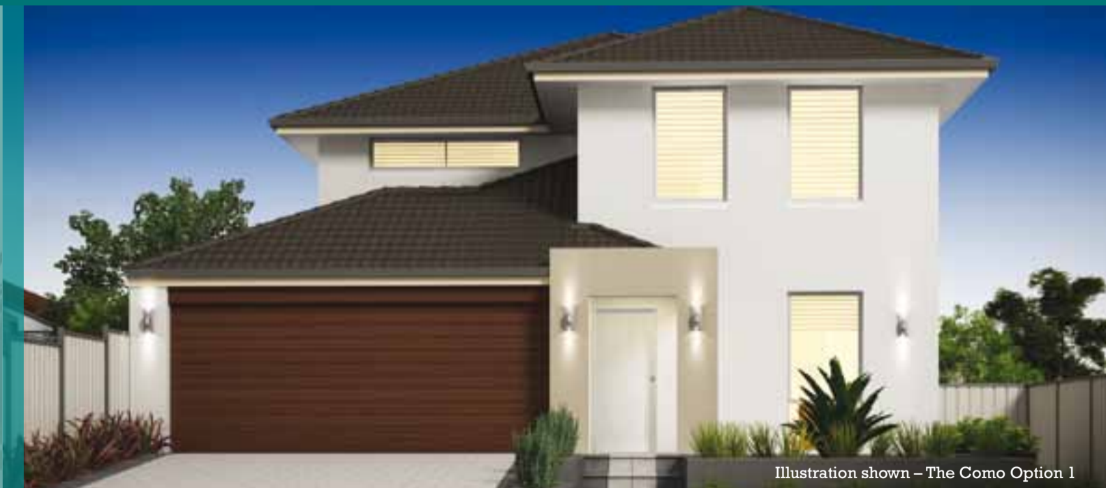
Illustration shown – The Como Option 1