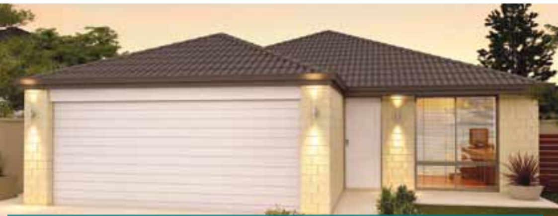
The Fortitude Standard Option