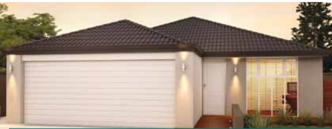
The Fortitude Option 1