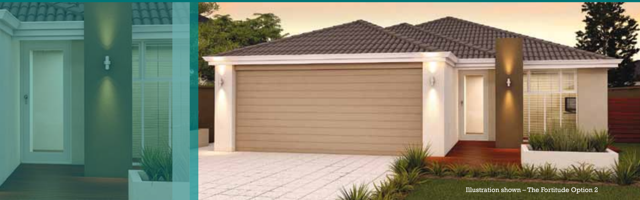
Illustration shown – The Fortitude Option 2

Quality and value for money come as standard.