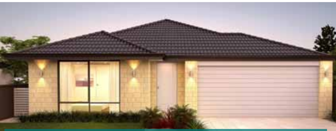
The Destiny Standard Option