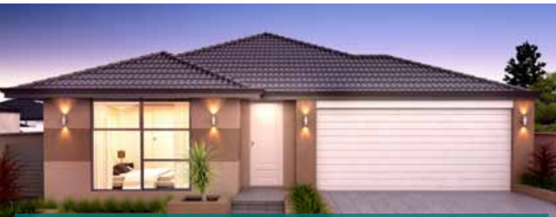
The Destiny Option 1